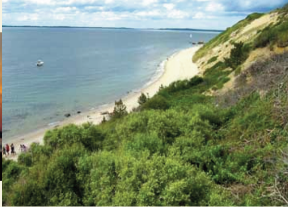
Uncrowded miles of beach are a brief stroll from your secluded private property. A roof deck has room for a dozen guests for drinks.

There are two approaches to the beach: wooden stairs (from which the view is incredible) and a lower, sea level entrance down island. Both are a short walk from the house.