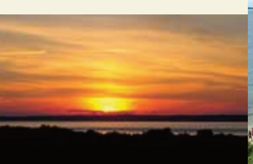
Panoramic View of Vineyard Sound From the Roof Deck

This house sits on a wooded knoll one-half mile back from the water and 75 feet above sea level. Views include the Vineyard Sound, the Elizabeth Islands, Woods Hole, and on very clear days, Buzzard's Bay and the mainland.